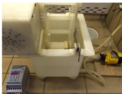
Figure 1: Reaction system for the leaching tests.

For this first step of the zinc recovery, operational parameters were tested in order to combine them and thus to find the best condition to proceed with obtaining the metal. A Full Factorial Planning 2^3 was carried out with the objective of evaluating what should be the most appropriate combination of factors for the zinc extraction from galvanized steel scrap. The factors tested were sulphuric acid concentration (0.1 and 0.3 M), reaction time (30 and 60 minutes) and rotation speed of the hexagonal drum (30 and 60 rpm). The reaction system used can be seen in Figure 1, consisting of a rotating drum, with a magnetic pump, for homogenizing the solution. In addition, it is important to note that all tests were performed according to a factorial planning and subsequent statistical treatment of the results.