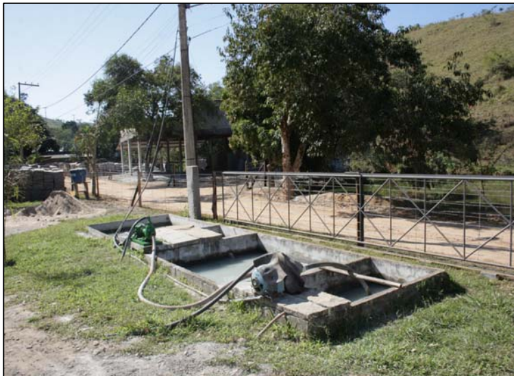
Picture 3. Stone saw-cutting mud tailings recovery.