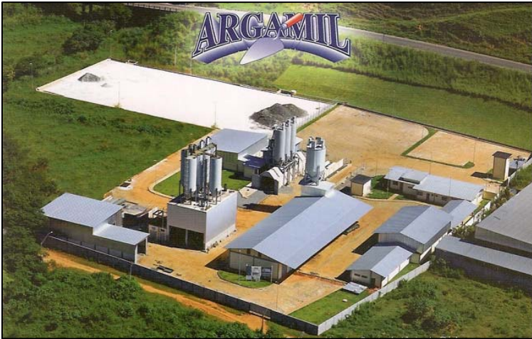
Picture 4. The mortar factory using tailings as input at Padua cluster.