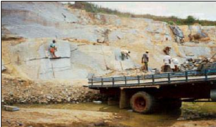
Picture 1. Typical quarry at Padua cluster.