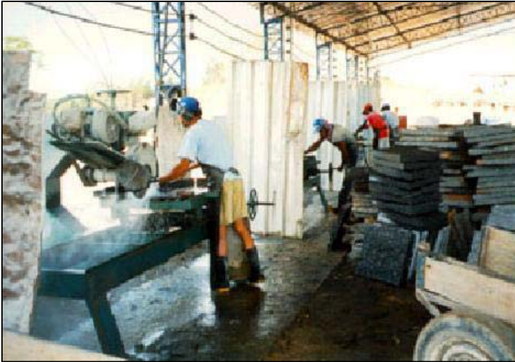
Picture 2. Typical tile cutting shop at Padua cluster.